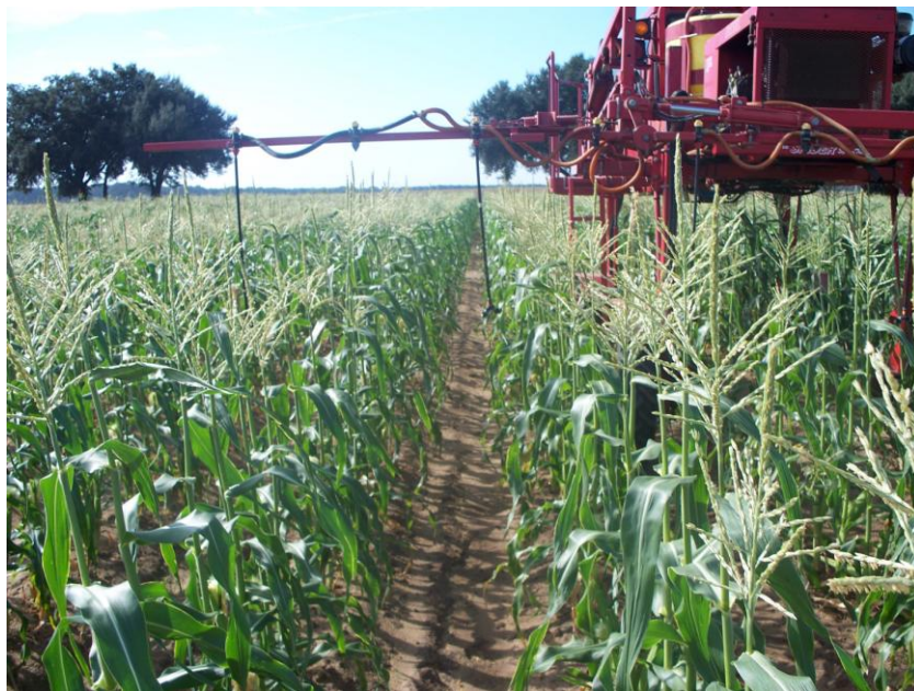
Spraying our fall sweet corn with insecticide.