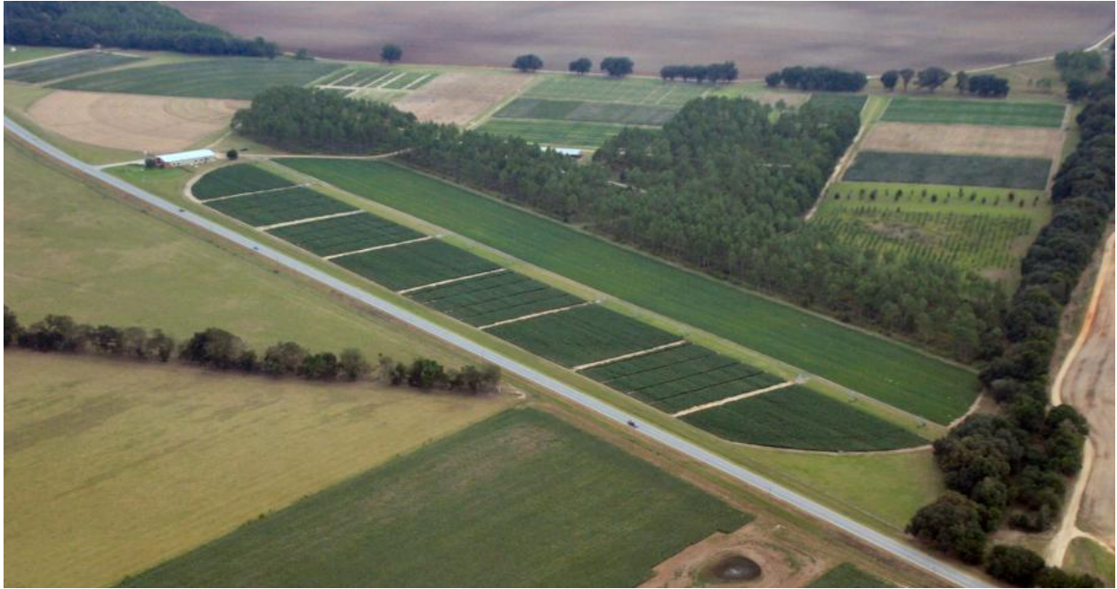
Recent aerial view of the Stripling Park.