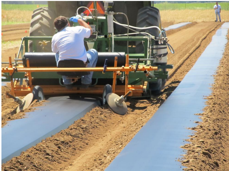
Laying plastic for drip tomatoes.