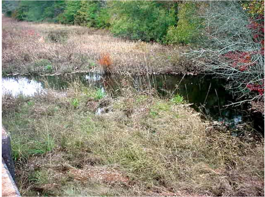
Double Run Creek North Side.