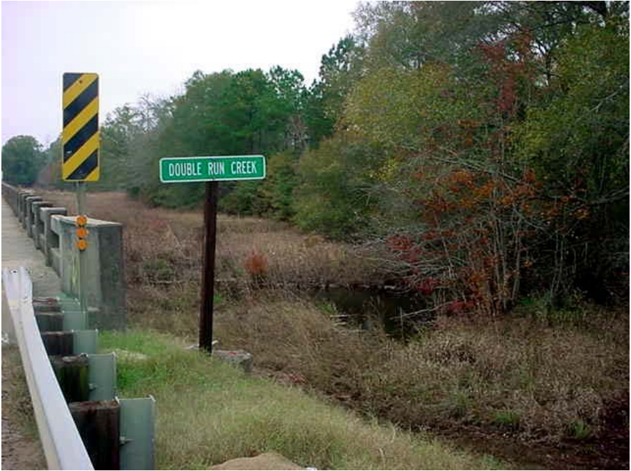
Double Run Creek.