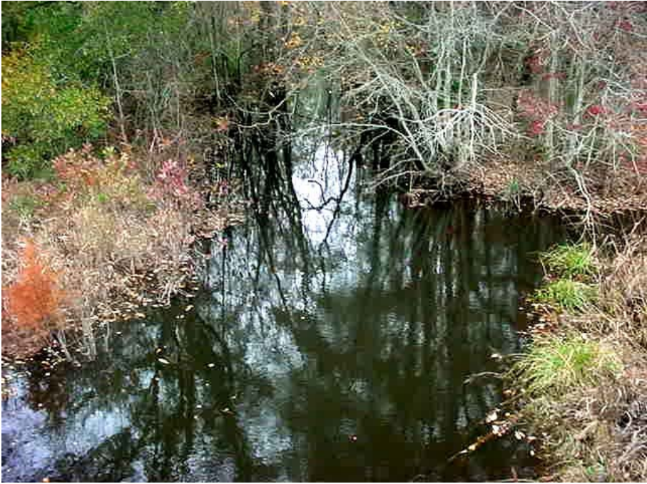
Double Run Creek North Side.