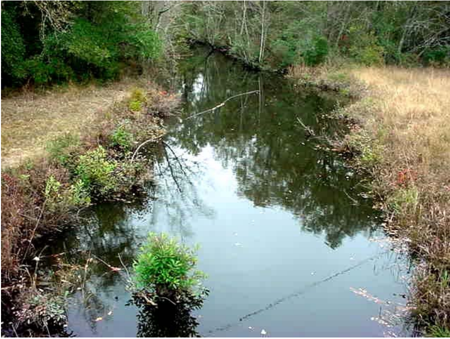
Double Run Creek South Side.