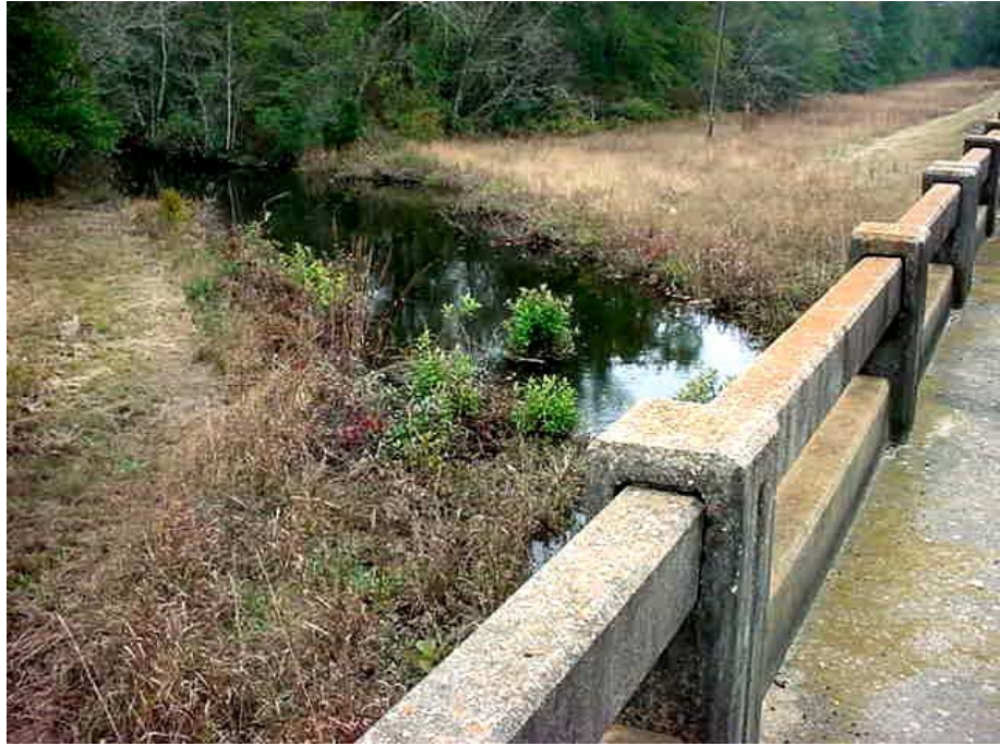
Double Run Creek South Side.